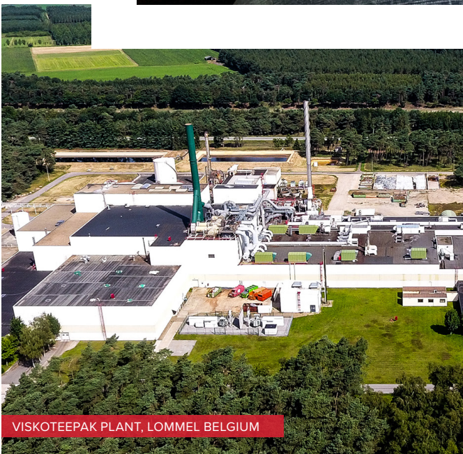
VISKOTEPAK PLANT, LOMMEL BELGIUM

“ViskoTeepak has a lot to offer and provides plenty of opportunities for personal development. Seize these opportunities with a positive mindset and make the most of them!”